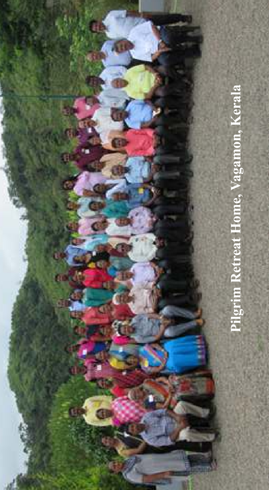
Pilgrim Retreat Home, Vagamon, Kerala